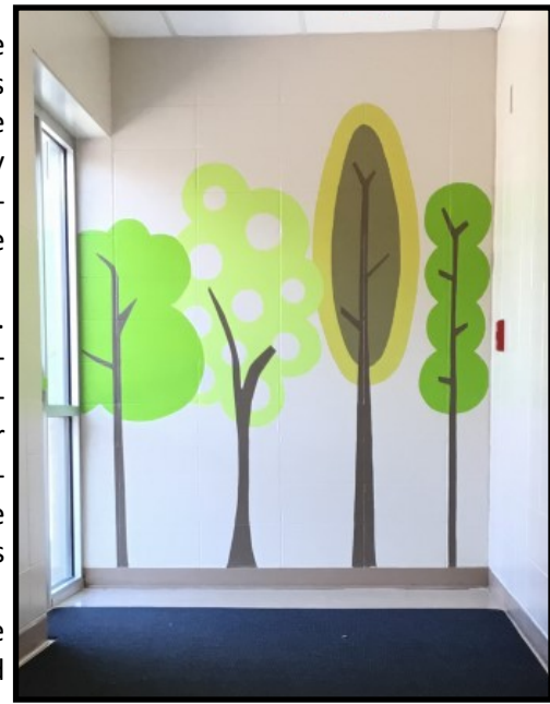
The new mural down the kindergarten hallway matches the energy, youthfulness, and creativity that occupies the residents of the hallway.