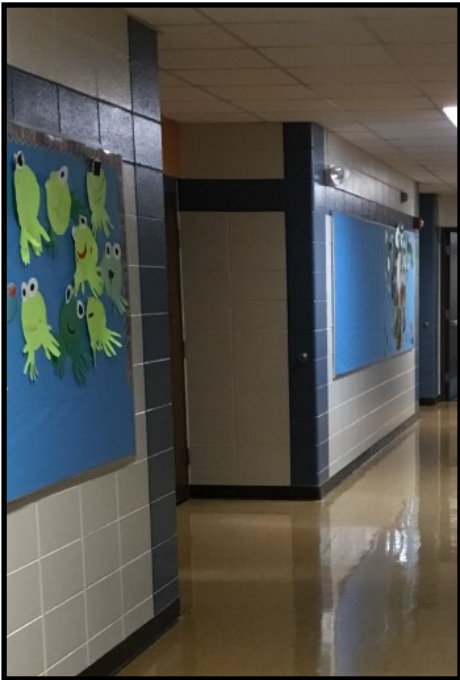
Along the top and all the sides of the corners in the elementary you can find a traditional blue stripe (shown). However, each grade received a different color at the inlet of their doorways to add the pops of color.

While the middle and high school area didn't see as much variety in color, there were still noticeable changes, especially around the stairs. Even just splashes of color were great ways to break up the monotony of the beige that once covered the hallways.