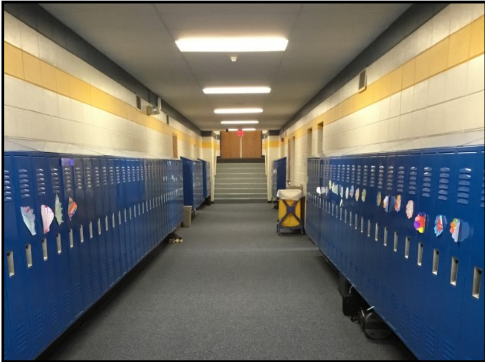
The 4th and 5th grade hallway had a huge makeover this summer including new carpeting in the rooms and the hallway, new lockers, and a fresh coat of paint.

In addition to the new teachers there are new students in about every grade throughout the school which is a promising sign at the growth, potential, and positivity surrounding Garretson.