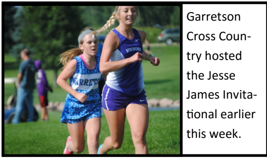
Garretson Cross Country hosted the Jesse James Invitational earlier this week.